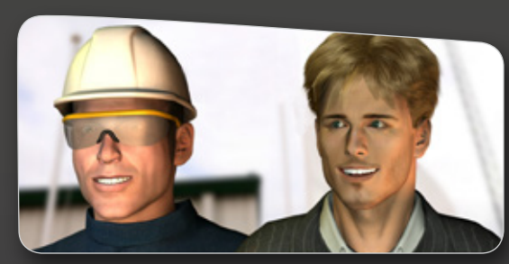
Alcohol, Drug and other Policies