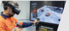
Mine Standards Training