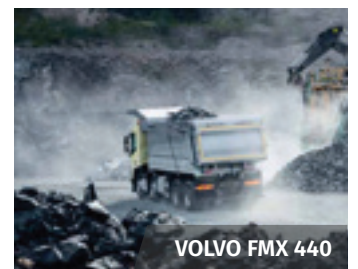
VOLVO FMX 440

As mining equipment becomes more advanced, the expertise and data required to accurately simulate these machines increases. Immersive Technologies combines deep industry experience with proven capability to deliver training solutions that set the benchmark for accuracy. The result is a true-to-life simulation that reflects real machine performance, giving operators the most reliable and effective training environment available.