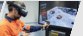
Mine Standards Training