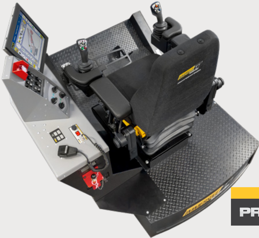
High fidelity LCD operator interface