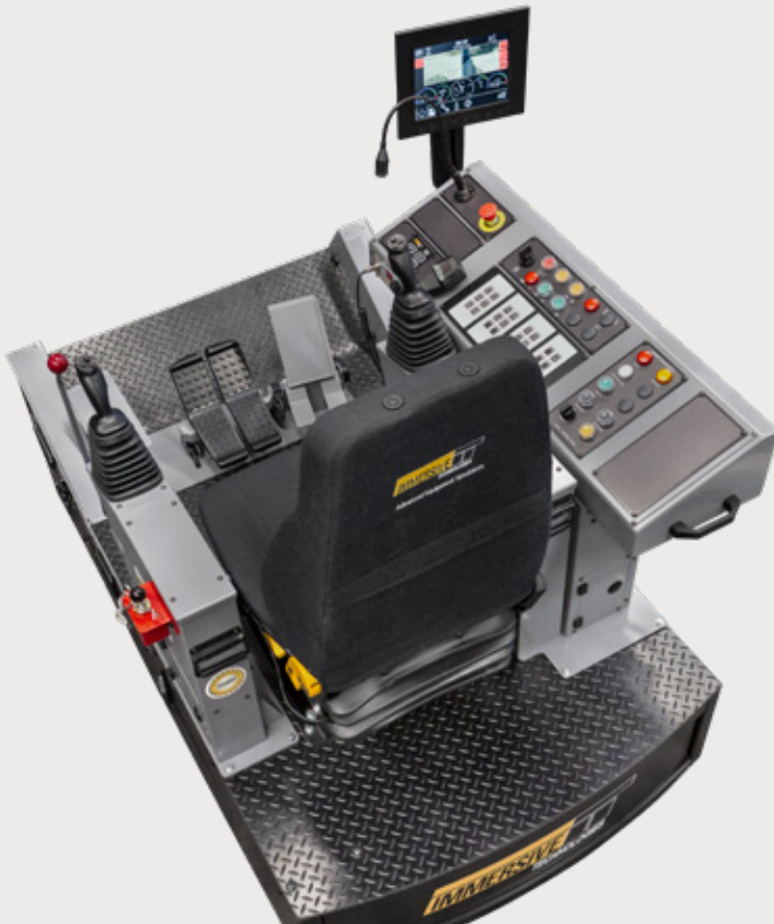
Simulated main display including gauges and two camera views.