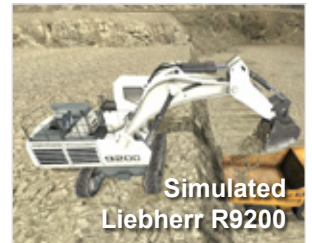
Simulated Liebherr R9200