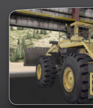
Startup / Shutdown