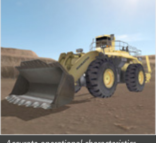
Accurate operational characteristics using technology and proprietary data licensed from Komatsu

With mining equipment becoming increasingly technically sophisticated, the level of information, experience and organizational competencies required to accurately simulate these machines also increases. Through Immersive Technologies' industry experience and exclusive alliance with Komatsu, you can be assured your training solution will be the only accurate and true representation of the real machine available.