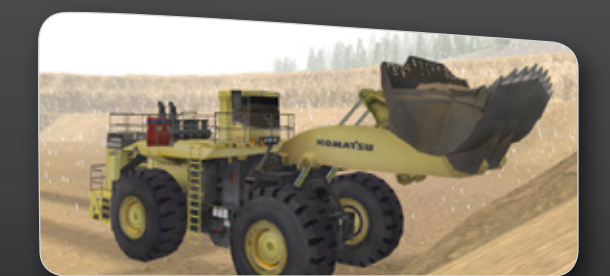
Adverse Weather Conditions