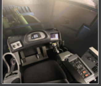
Conversion Kits<sup>®</sup> utilize genuine Komatsu cab controls and instrumentation

Enquiries@ImmersiveTechnologies.com www.ImmersiveTechnologies.com