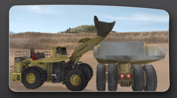
Safe Operating Procedures