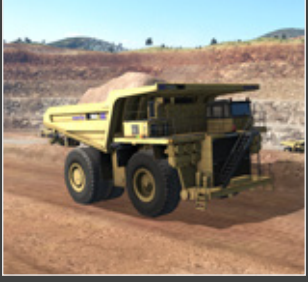
Accurate operational characteristics using technology and proprietary data licensed from Komatsu

With mining equipment becoming increasingly technically sophisticated, the level of information, experience and organizational competencies required to accurately simulate these machines also increases. Through Immersive Technologies' industry experience and exclusive alliance with Komatsu, you can be assured your training solution will be the only accurate and true representation of the real machine available.