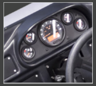
Conversion Kits utilize genuine Komatsu cab controls and instrumentation

© Copyright 2014 Immersive Technologies.