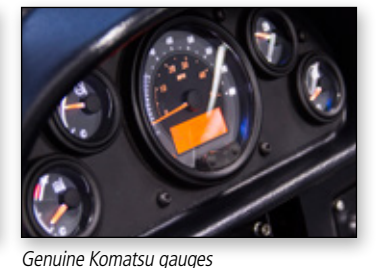
Warning light cluster displays machine health