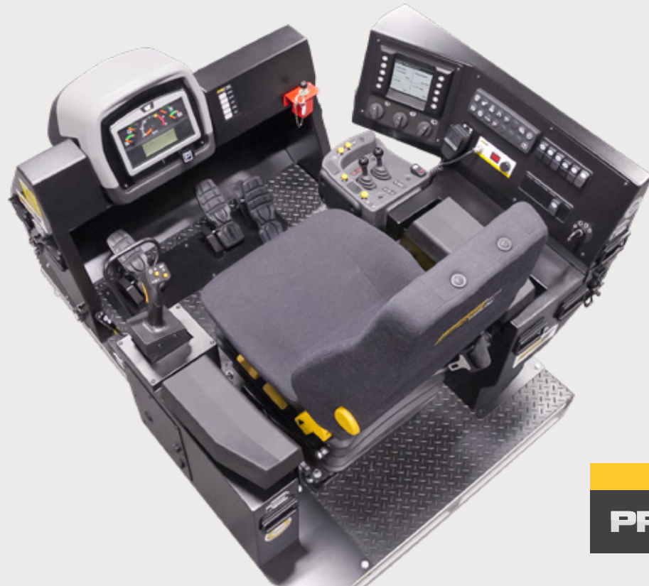
Genuine CAT gauge cluster