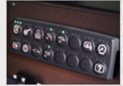
STIC™ steering and transmission control