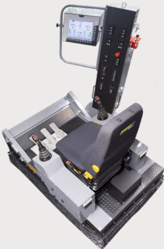
Simulated Caterpillar BCS version III