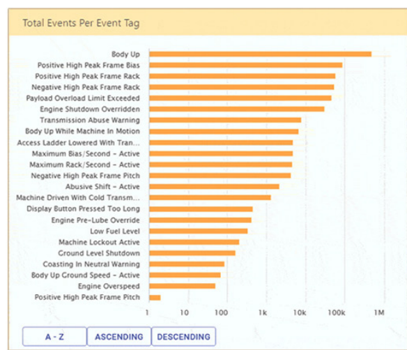
Operator Performance Analytics (OPA) dashboard samples

OPA data can also be filtered specific to machine errors, performance on different machines, performance over time and training history to locate the root cause of a performance trend. An initial dataset was analysed using 6 months of machine operational data from the field and simulator data. This was used to identify outlier operators in terms of risk rating or performance against key metrics (such as spot time, average speed loaded and average tons per km/hr).